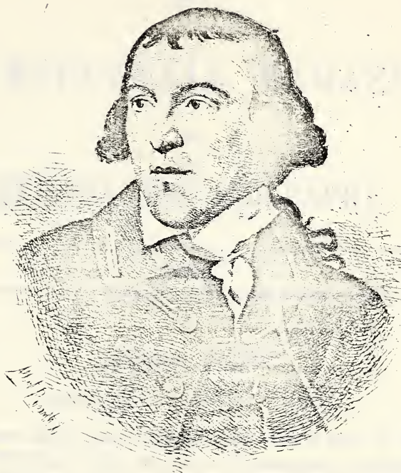
ANDREW ALLEN. Member of the Continental Congress.