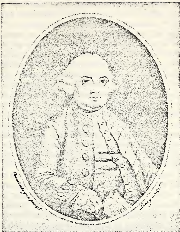
William Strahan Esq. r From a Painting in the Possession of John Spottiswoode Esq. r